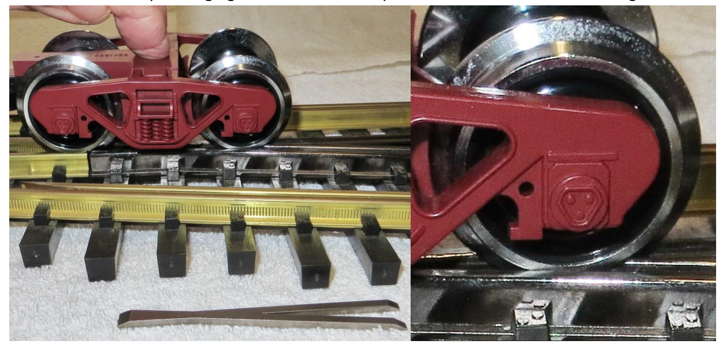
Example LGB truck with deep flange wheel drops into frog throat

In addition to obnoxious audible affects, the frog point & wing rails, when repeatedly struck by wheels, can develop damaging wear as wheels drop into & then come out of the frog throat.