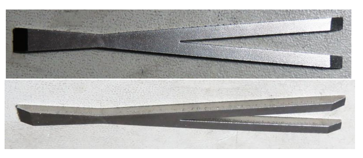
The insert fits both left and right Aristo-Craft No. 6 turnouts and is held in place by gravity. Drop in the Frog Legs Insert into the throat of the frog with end "ramps" facing up.

"Frog Legs" Stainless Steel Corrective Insert (Prevents wheel from totally dropping into Frog throat)