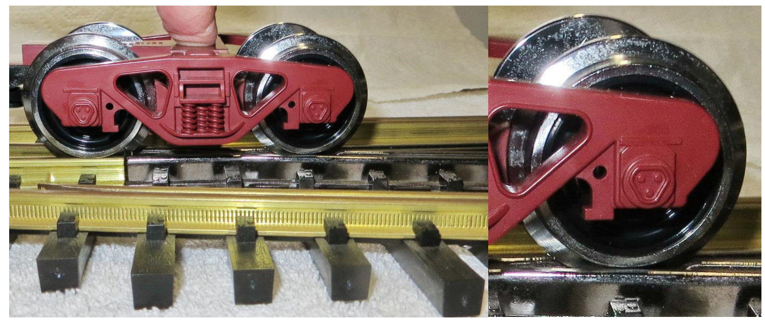
Example LGB same truck wheel flange rides on insert - wheel does not drop into frog throat